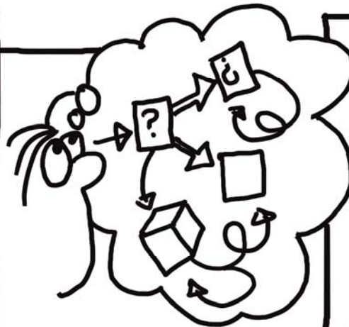
MODELS OF MEMORY

UNDERSTANDING HOW OUR MEMORY IS STRUCTURED AND HOW WE CAN USE THIS TO UNDERSTAND EYEWITNESS RELIABILITY